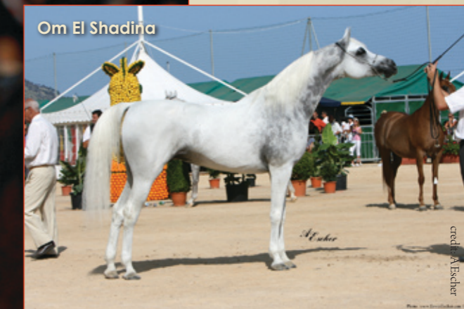
Om El Shadina