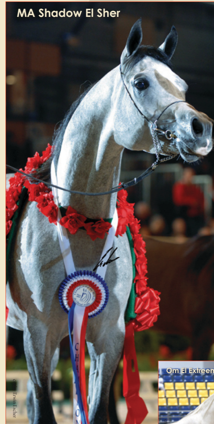
MA Shadow El Sher

*El Shaklan has touched so many people on many different levels since his birth in 1975. On a personal level, I must express my gratitude to him. Without him, I would not be the person that I am today. I was also born in 1975 and have never known a time without him. He gave my family everything. We moved from Germany to the United States because of him. We bought the farm that is still the home of the Om El Arab breeding programme today because