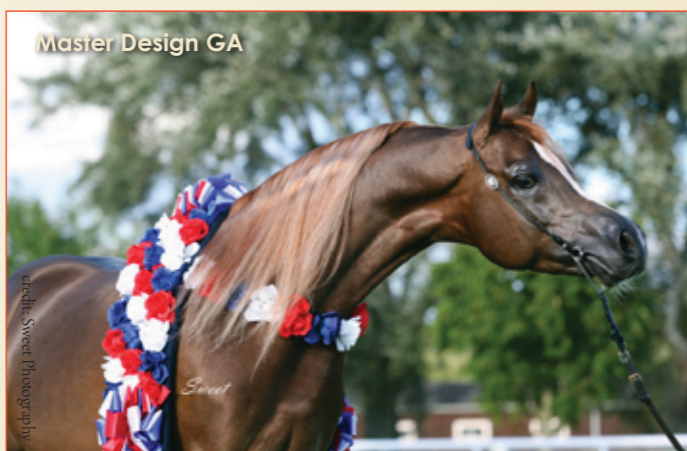
Master Design GA

US National Champion, Eternity, is *Sharem El Sheikh's most famous son. We have several "Sheikh" daughters on our farm that we have bred back to *Sanadik El Shaklan or Om El Shahmaan. Some of the more well-known horses resulting from these specific lines are Om El Bernadette, Om El Extrem, Om El Exquisit, Om El Bellissimo