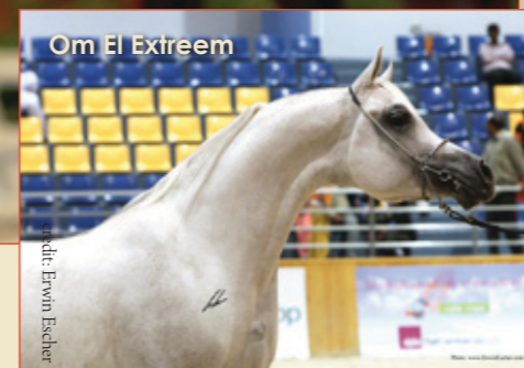
Om El Extreem

of him. He paid for my university education, my first car and the list goes on, even today. I can look out of the window as I write this and admire the incredible view of the farm that we have because of *El Shaklan. He truly has given me an identity and a sense of belonging to something larger than life. I can go to any show in the world and admire his descendents. I feel that they are a part of our family. And I feel like I am truly blessed.