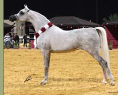
Eagleridge Passionata (x River Oak Divinity), Elran Cup Senior Champion Mare, Al Khalediah Arabian Horse Festival Reserve Champion Mare, Qatar International Reserve Champion Senior Mare, and Dubai Reserve Champion Senior Mare.