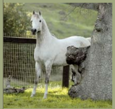
Om El Jimala (x Om El Jazira), twice U.S. National Reserve Champion Senior Mare.