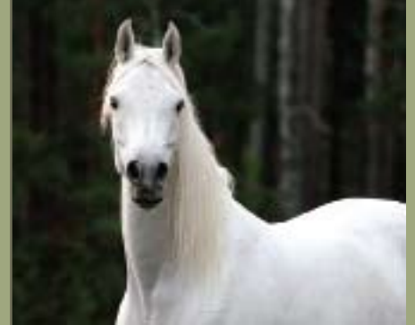
Ferrara (x Fera), Finnish National Champion Mare.