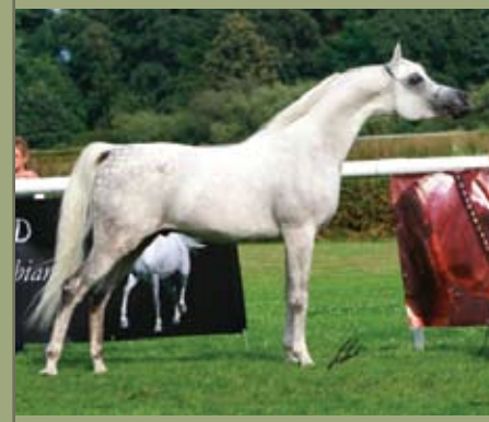
Om El Extrem (x Omel Bint Shaina), Supreme National Champion Stallion of Spain; World Champion Most Classic at the Salon du Cheval; International Junior Champion Stallion, Elran Cup; and Orientalica Supreme Champion Stallion.