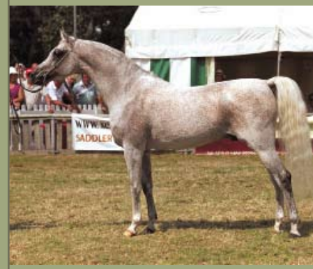
Fatal Attraction (x Falling In Love), Senior Champion Stallion, Malvern.