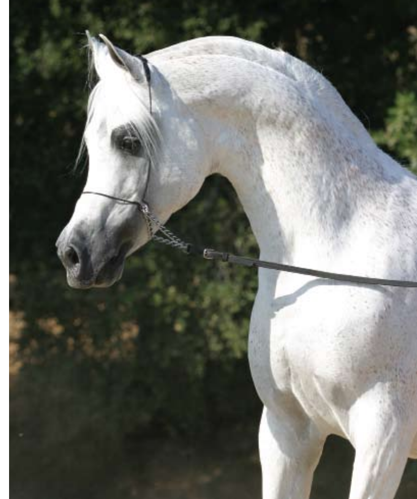
*Sanadik El Shaklan