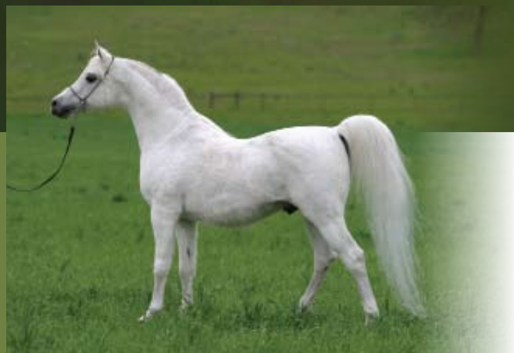
Bottom left: *Sanadik’s dam *Mohena (Hadban Enzahi x Morisca V).