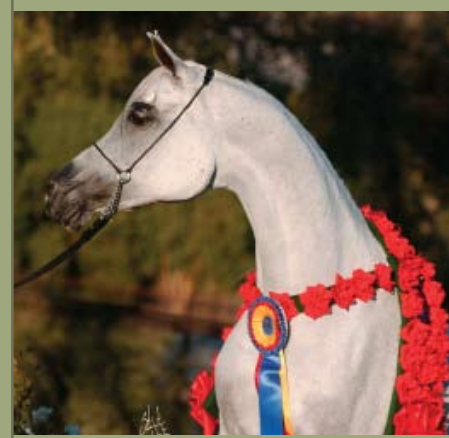
*El Dorada (x Emigrantka), European and Polish National Junior Champion, Polish National, All Nations Cup, U.S. National Champion Senior Mare, and European Senior Reserve Champion.