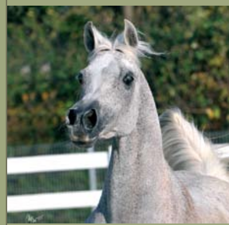
Om El Sanadiva (x De La Reina), World Champion Mare, Elite Mare of the German Arab Horse Society, and European Champion Mare.