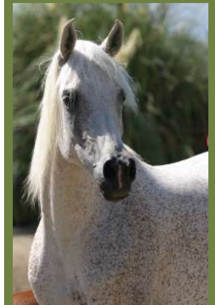
Bottom: The *Sanadik El Shaklan son Om El Exquisit out of Om El Bint Shaina (*Sharem El Sheikh x Om El Shaina).