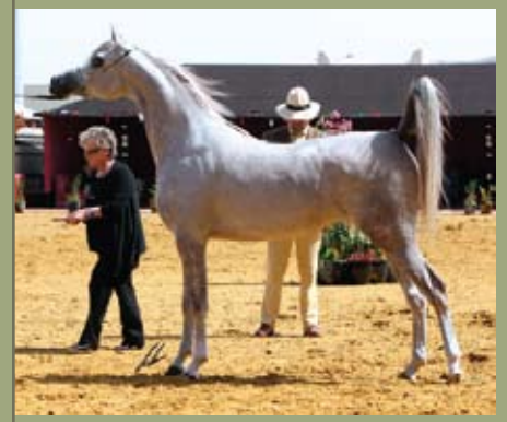
Om El Bernadette (Om El Shahmaan x Om El Benedict by *Sanadik El Shaklan), Las Vegas Breeders Cup Champion Junior Mare; Junior Champion Filly at the International ECAHO A-rated Sharjah, UAE, show; and first place Three-Year-Old Filly, Qatar Championships.