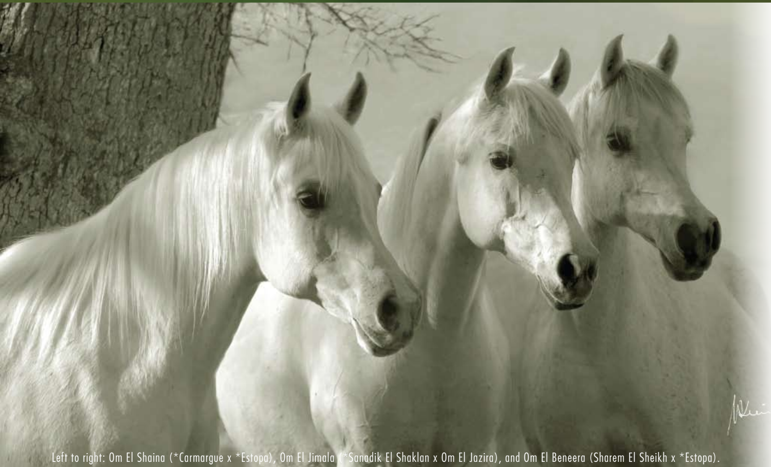
Left to right: Om El Shaina (*Carmargue x *Estopa), Om El Jimala (*Sanadik El Shaklan x Om El Jazira), and Om El Beneera (Sharem El Sheikh x *Estopa).